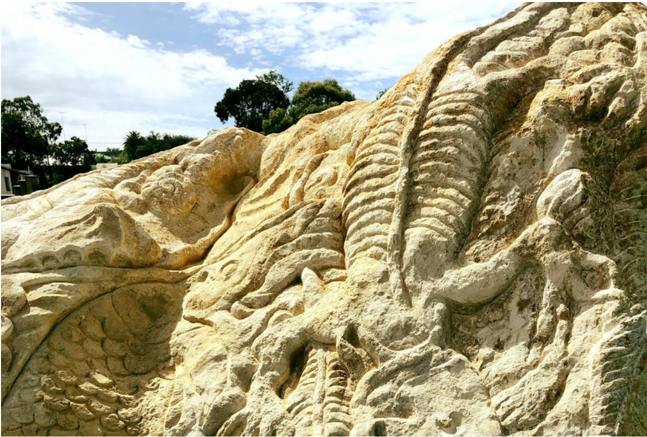
Marine Fossil Carving, Wayan Dudug Memorial Parklands