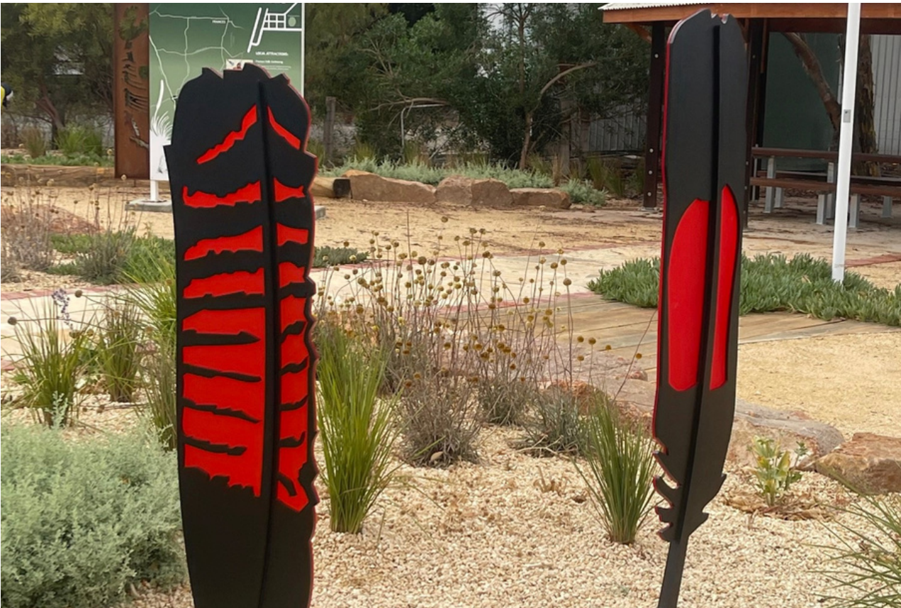
Red Tail Black Cockatoo Frances Town Square