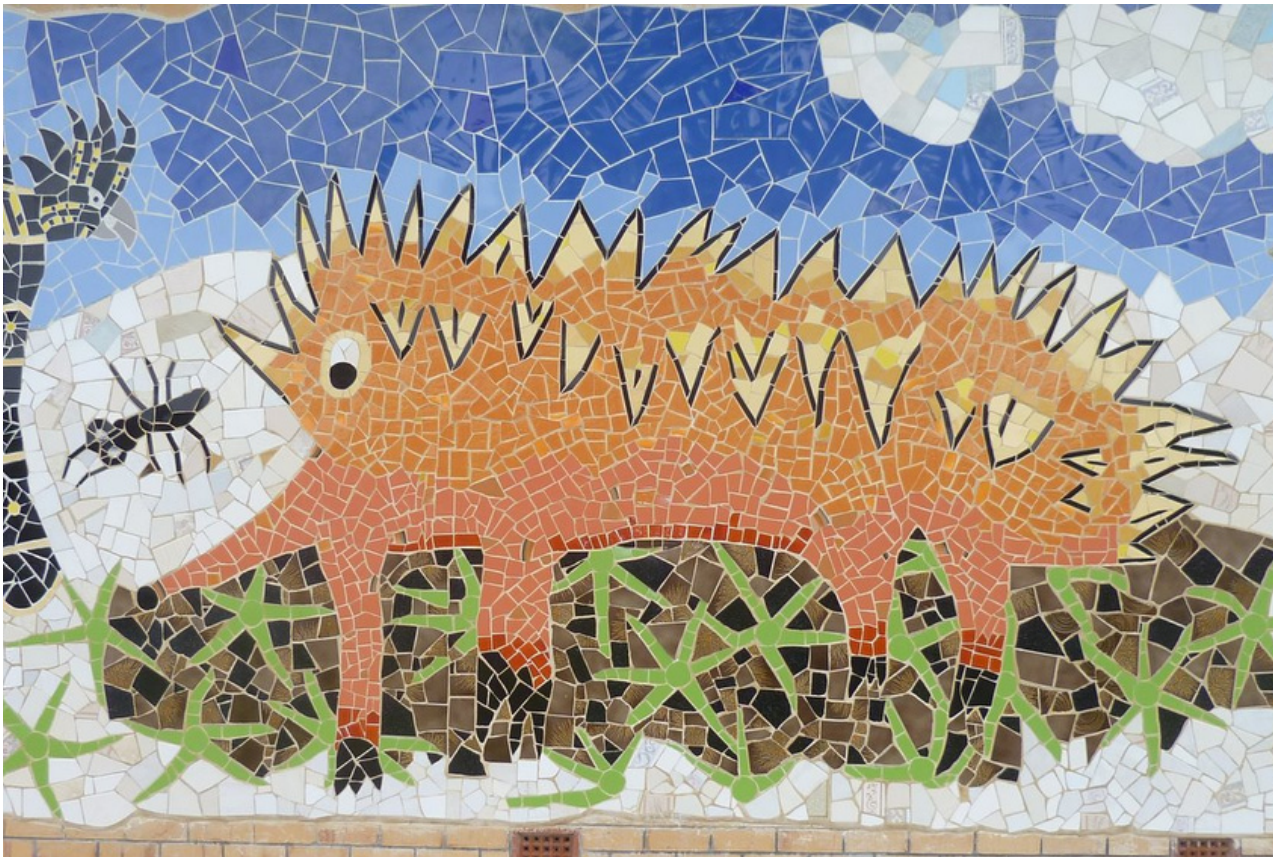
Mosaic Mural Naracoorte Swimming Lake